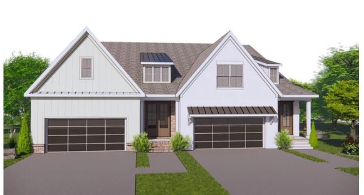
Cambridge I | Duchess J

CenturyCommunities.com/ParkAtWiltshire | 615.234.6090