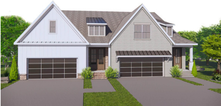
Cambridge A | Duchess B

2,122 Sq.Ft. | 3 Bed | 2.5 Bath | 2-Bay Garage +Bonus Room