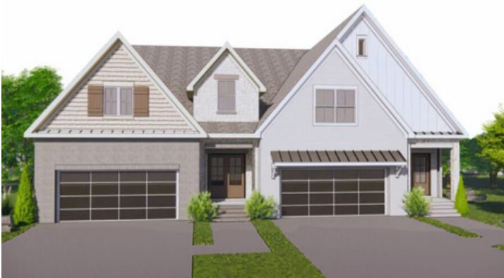
Cambridge G | Duchess H