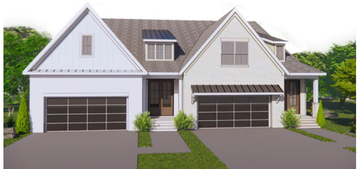
Cambridge E | Duchess F