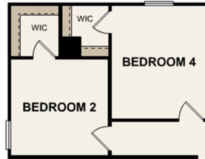
OPT. BEDROOM 4