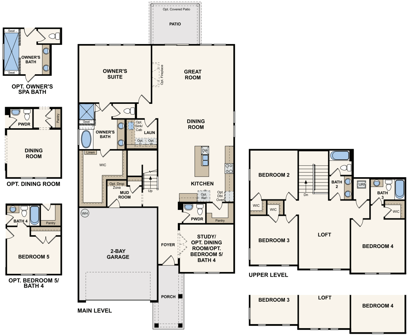
OPT. ELEVATION B31