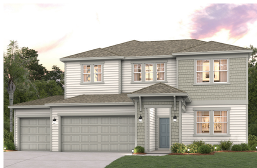
ELEVATION C11 W/ 3RD BAY OPTION