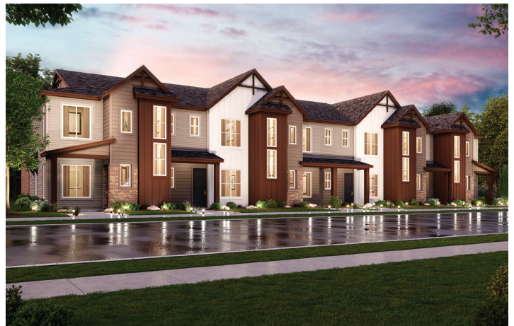
ELEVATION B - 6 PLEX