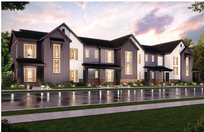
ELEVATION A - 6 PLEX