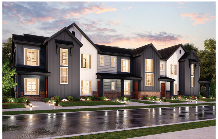
ELEVATION A - 5 PLEX