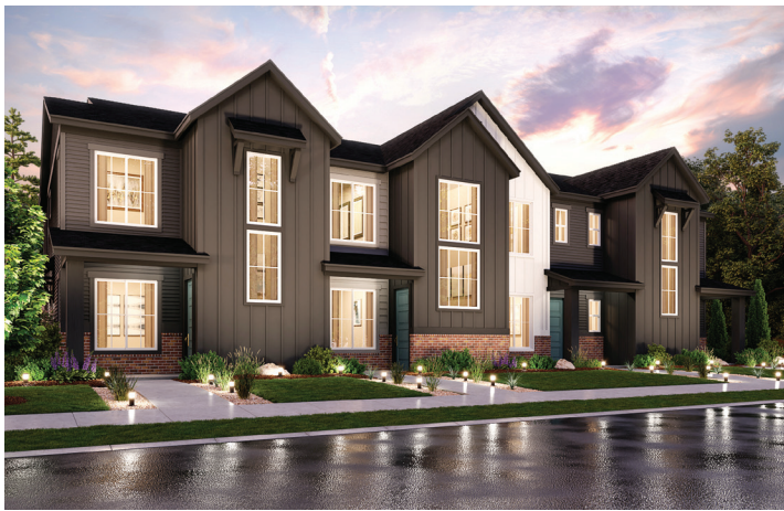
ELEVATION A - 4 PLEX

APPROX. 1,368 SQ. FT. | 2-STORY | 3 BEDROOMS | 2.5 BATHROOMS | 2-BAY GARAGE